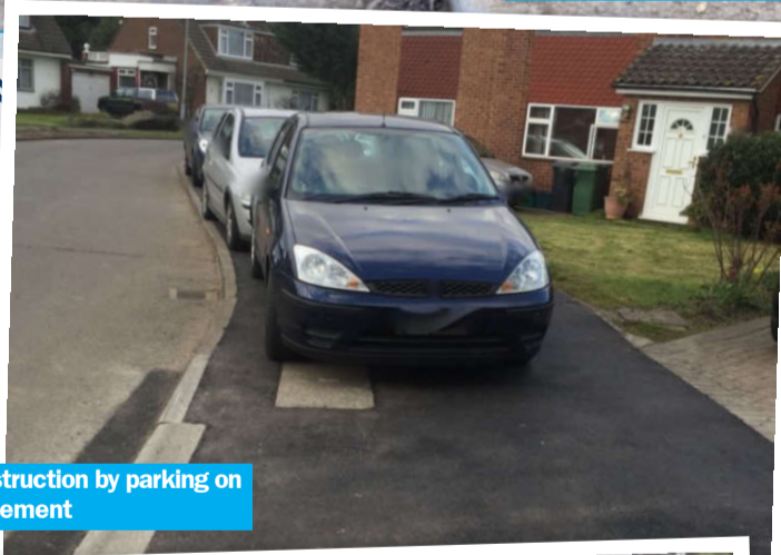
Obstruction by parking on pavement