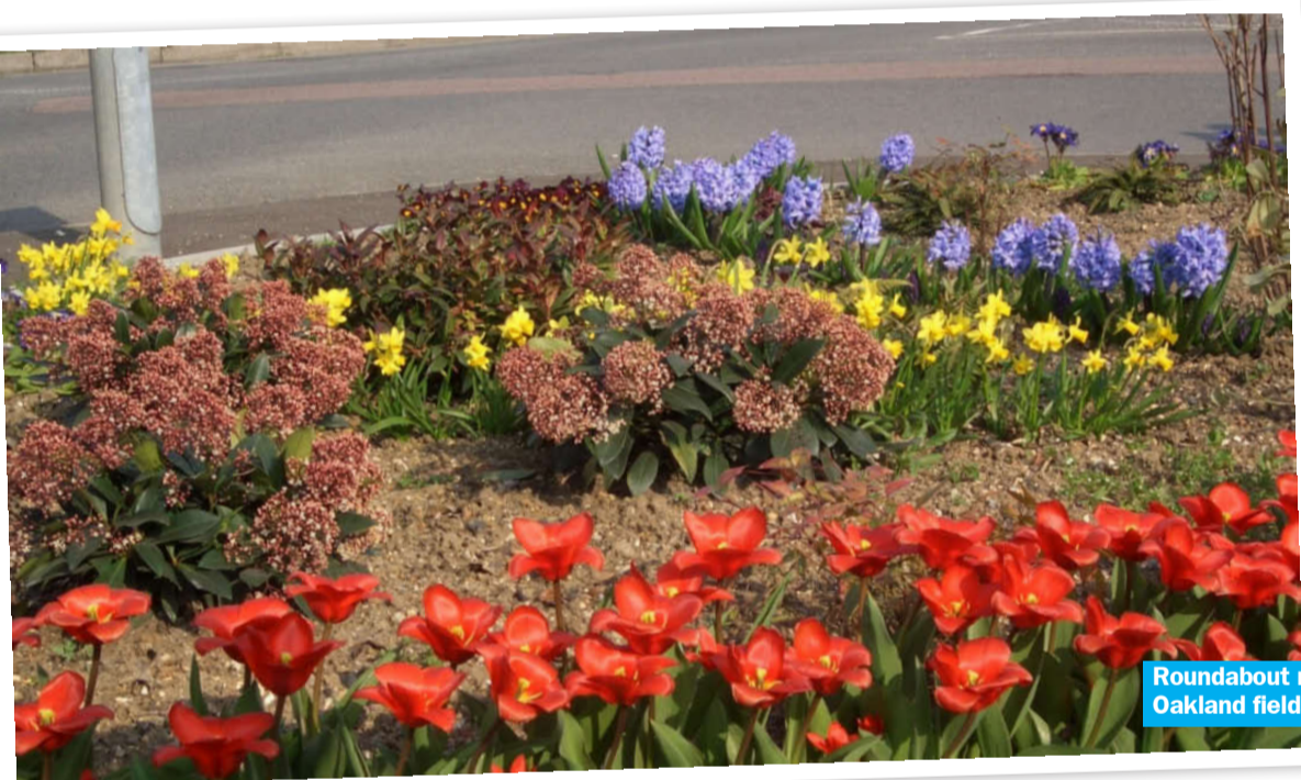
Roundabout near Oakland fields