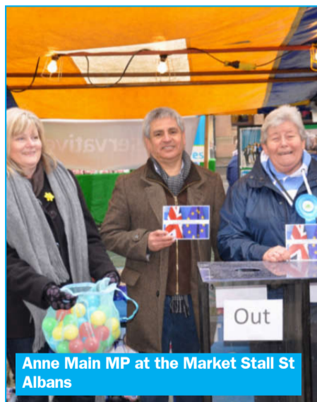
Anne Main MP at the Market Stall St Albans

This was intended as a FUN exercise and it was!